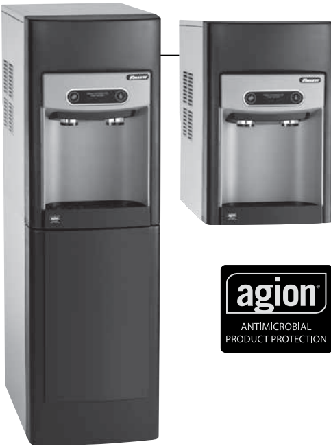
Shown with optional base stand

NOTE: For use in applications with greater than 5 mg/l but less than 400 mg/l total dissolved solids in water and less than 200 mg/l hardness (either naturally occurring or treated with reverse osmosis or other TDS reducing technology). Not recommended for use with softened water.