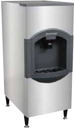
Easy Push Chute