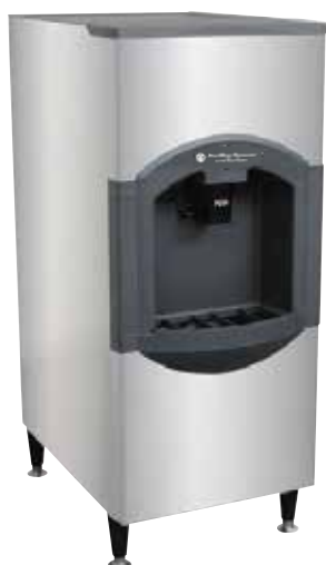
Easy Push Chute