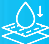
Reverse Osmosis Membrane

Reduces chlorine, chemicals, and pesticides.