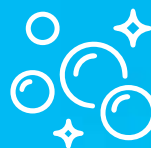
BIO-SURE PLUS™ Filter

Reduces dissolved solids, pharmaceuticals, and metals.